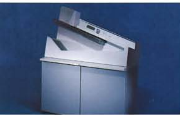
Closed view of Model 206.

* Tyvek is a registered trademark of Dupont Corporation