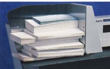
Feed area accepts various size envelopes.