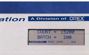
Job running/batching status.