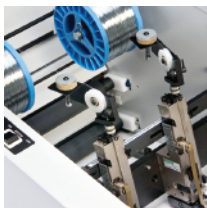
Magnetic stitching heads feature "one-step" threading for quick and easy set-up.