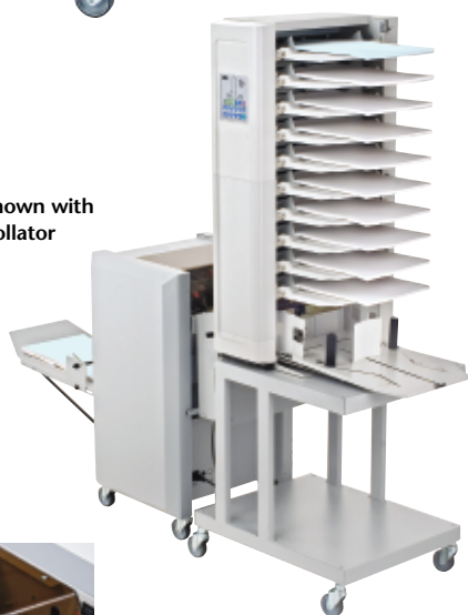
Sprint 5000 shown with MBM FC 10 collator