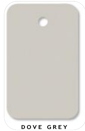
DOVE GREY 002