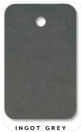
INGOT GREY 006